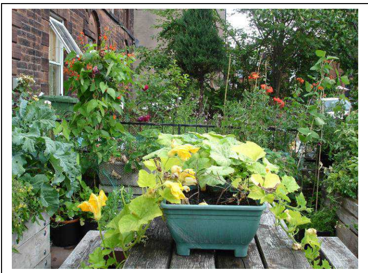
To have created a garden patch is to have succeeded-Emerson. To do it with others, magic!

Local residents are invited to weed, water or just sit in this peaceful area.