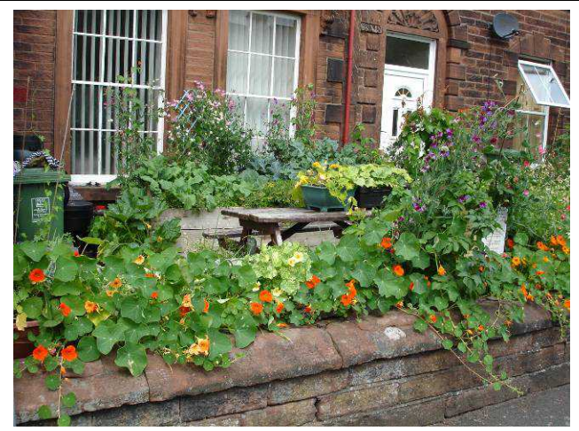
Over 40 food boxes included fresh veg from the beds.

Surplus fruit and veg from other local gardeners wishing to share is left on the picnic bench and wall for people to help themselves for free.