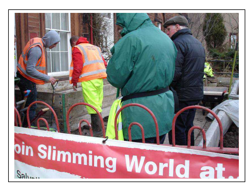
Stage 2- Getting on with the planting

Pay Back lads came again and filled the boxes with soil donated by Metcalfe Plant Hire Ltd