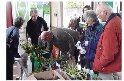
Bolton Launch Event

This project has enabled Freegle and PACT to support and encourage two community projects in Penrith and one in Appleby: